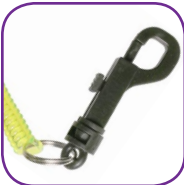
Plastic swivel hook

A tether becomes useful when it is attached to something. This catalog shows our most popular hardware options but that is only the beginning. There are nearly as many ways to connect tethers as there are uses for them. Some ideas are below. Call us and we'll help with your design questions.