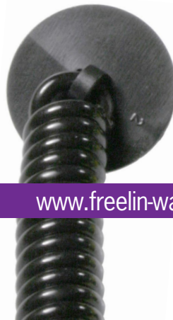
90° weld with adhesive button