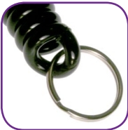
90° weld with split ring (.34" to 1.25" available)