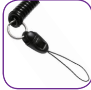
Personal electronic devices