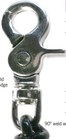
90° weld with trigger hook