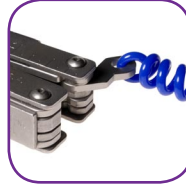
Tether your tools