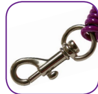
Trigger snap hook