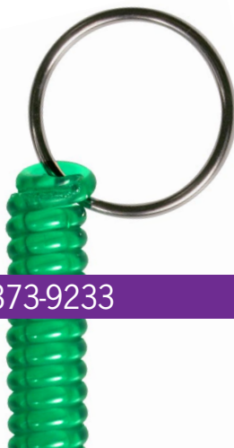
Flat weld with split ring