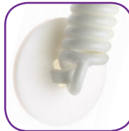
90° weld with adhesive button (3/4" & 1.5" available)