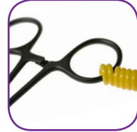
Fishing and water sports