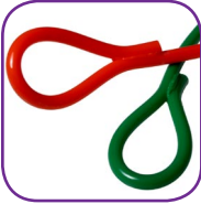
Lap fused loop

a 90° Fused Loop and a Flat Weld. The 90° is probably better for most applications because it means the tether will hang straight while providing optimum mobility for most attachments. Alternatively, the flat weld is a slightly more secure method of attaching your hardware.