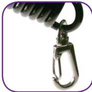
90° weld with snap swivel