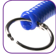
Flat weld with book ring