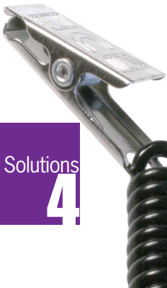
90° weld with badge clip